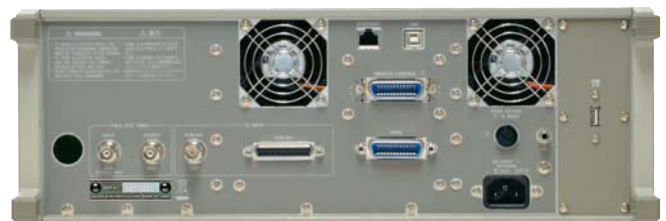
Shown with Option 71

Up to 100 preset conditions can be stored in the memory. Since the stored contents can be categorized into 10 groups, the preset mode is convenient for inspection applications.