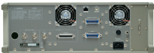
Shown with Option 71