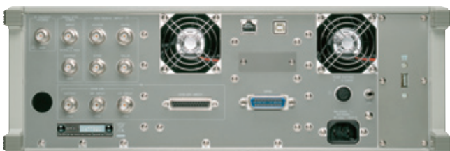
Shown with Option 71