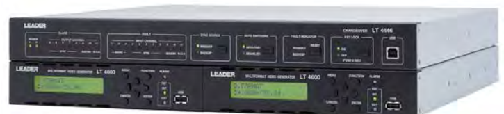
LT4446 changeover on top of two LT4600 side by side.