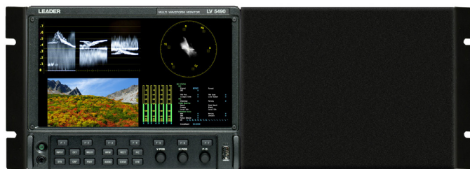
LR-2490 Rack Mount and LC-2190 Blank Panel